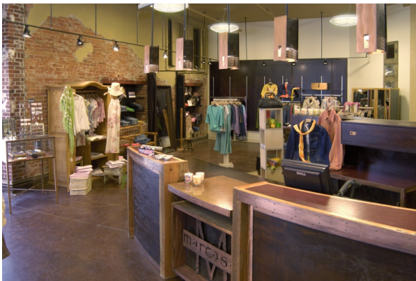
MARCASA CLOTHING STORE, INTERIOR