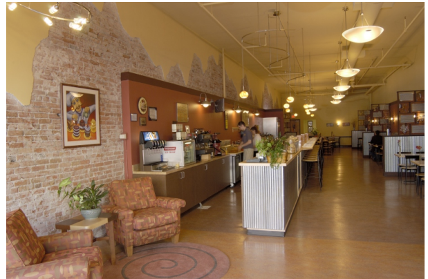
THE SOUP PLACE, INTERIOR